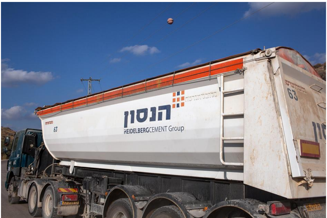
A Heidelberg Cement Group truck, which says “Hanson” in Hebrew, leaves the Nahal Rabba quarry.

Israel’s Supreme Court, however, rejected the Yesh Din petition in 2011, although it recommended that in general the Civil Administration not approve new quarries. The court based its opinion in part on the theory that “traditional occupation laws require adjustment to the prolonged duration of the occupation,”