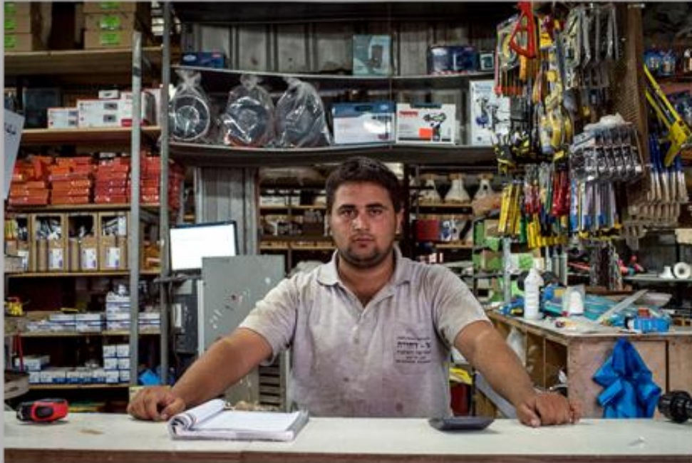
The Palestinian owner's son stands in a construction supply shop located on a main road leading to the settlement of Ariel. Like thousands of Palestinian-owned homes and structures in Area C and East Jerusalem, the entire business is threatened with Israeli demolition orders. Israel has zoned only one percent of Area C for Palestinian construction and rejected more than 94 percent of Palestinian construction permit requests from 2000 to 2012.