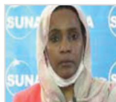
Sara Hassanain Former Acting Minister of Health