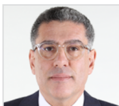
Karim El Aynaoui Mohammed VI Polytechnic U.