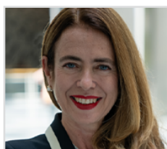
Roberta Gatti The World Bank