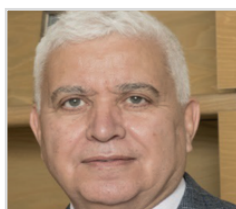
Abderrahim Bouazza Bank Al Maghrib