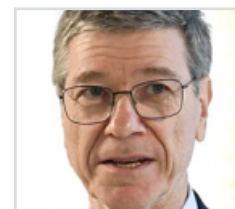
Jeffrey Sachs Columbia University