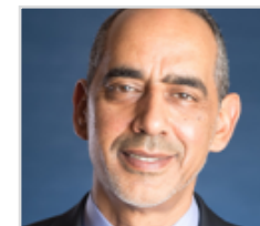
Tarik Yousef Middle East Council